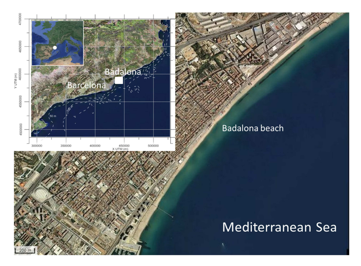
Figure 1. Study area (Catalan coast, NW Mediterranean Sea) indicating the location of Badalona beach, the selected case study

This contribution, whose main aim is to improve the available knowledge for such NBS, is structured as follows. Section 2 describes the methodology, with emphasis on the modelling tools and hydrodynamic scenarios. Section 3 assesses the performance of the proposed green interventions, whose behaviour is discussed in Section 4. Section 5 presents some preliminary conclusions.